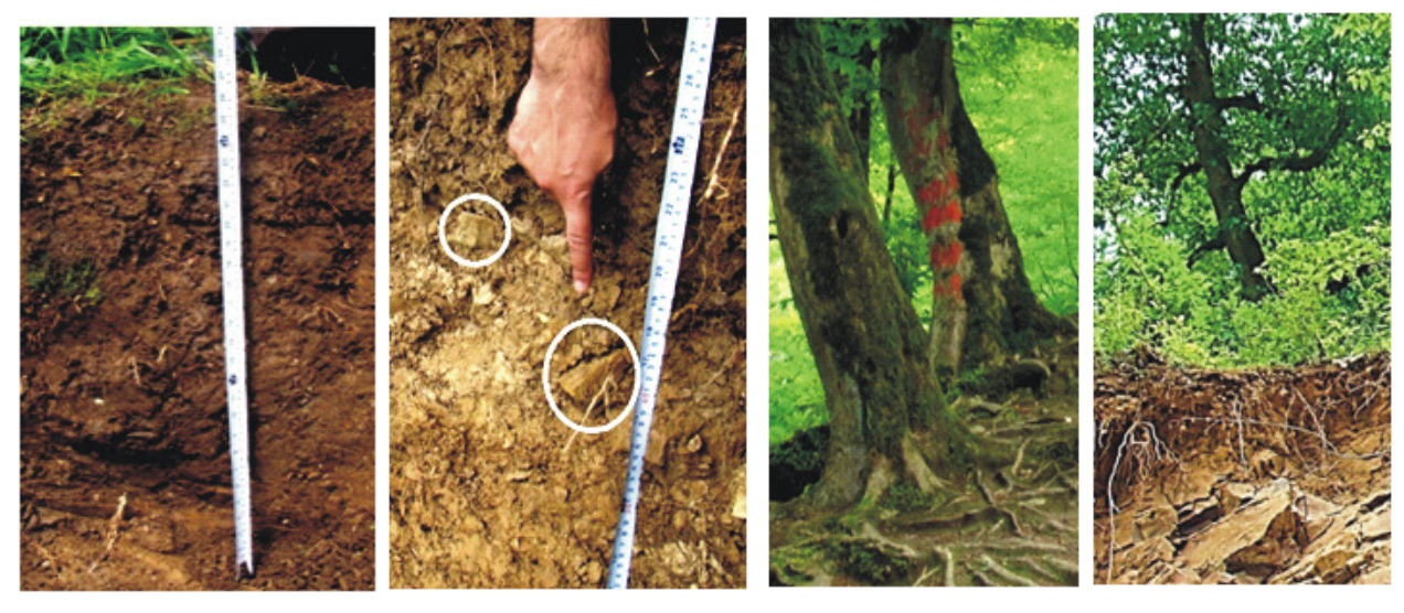
Root protrusionsAcidic Brown soilFig. 2. Different types of soil in the study area.